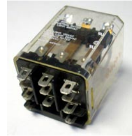
Eleven (11)Pin Control Relay

Amp Ratings Vary Triple Pole / Double Throw (11 Pin) Up to 600 Volts across relays Base NOT Available Connect with 1/8" Spade Terminals