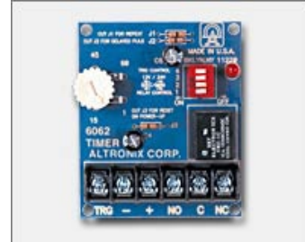
One Shot Timer

One Shot Timer (24 or 24 Volts DC input ONLY) Constant input voltage closes relay momentarily. Relay drops when input drops