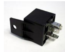
Five (5) Pin 12 Volt dc Motor Relay