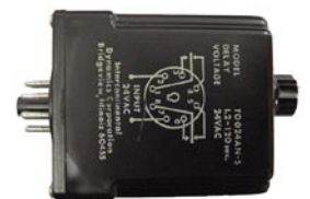
Eight Pin Plug-In