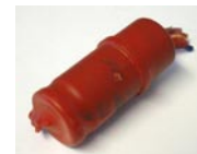
Delay Reverse Module

24 VAC ONLY (when opening & closing) Commonly used in older models