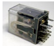
14 Pin 12 Volt dc

Fourteen (14) Pin Control Relay 30 AMP Rating Base is available but not shown