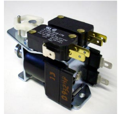
Eleven (11)Pin Control Relay

Each time 24 Volt AC Power is applied, the relay toggles Each toggle position has NO / NC / COM Up to 250 Volts across relays Connect with 1/8" Spade Terminals Order # 2500-417