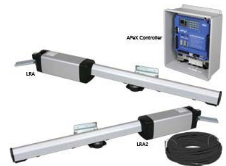
Double Gate Kit Shown